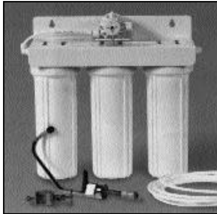
MUC-103 shown above